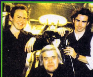
The creator of Alien , and the two guys that thought up Alien War .

H ow many of you have been to Disneyland and seen that cute little mouse, Mickey? Okay, how many of you have been chased down dark, dingy passages, by a slimy black alien that wants to eat you for dinner? Well, later this year you'll have that chance, there will be a new attraction for you to visit in London. From the end June,