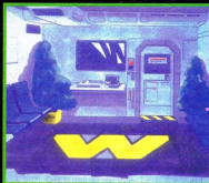
Ah, the pleasant waiting room, and an Alien bursting from your chest.