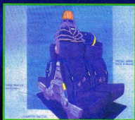
This is an artist's impression of... er, silly seat things.

Most of the cast from the first three films have been asked to attend the opening of Alien War , and Sigourney Weaver has said she'll turn up as long as she's not busy working. The actual location is expected to be in either Covent Garden or near Trafalgar Square. Admission will be around £6.