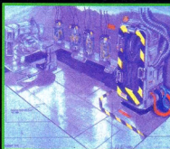
This is the 'Med Lab', don't ask me about it because I don't know.