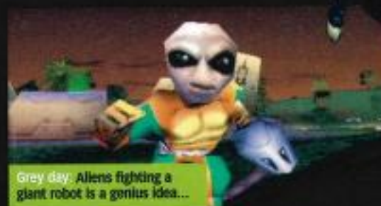
Grey day: Aliens fighting a giant robot is a genius idea...

Star Trek's great for aliens. Admittedly most of them look like humans with bad skin, funny ears or Cornish pasties glued to their foreheads, but who's to say that real aliens don't look like that? Perhaps the Cornish pasty was actually inspired by Klingons visiting Cornwall in the distant past! Stranger things have happened. Star Trek: The Next Generation at least brought us the Borg, one of the best alien races ever. Another batch of biomech half-breeds, their hive mind structure and ability to adapt to almost everything makes them a pretty scary breed to go up against. And, naturally, in Star Trek: Invasion you get to go up against the Borg and smack 'em down! Just don't forget to keep randomly adjusting your shield wavelength. Or something.