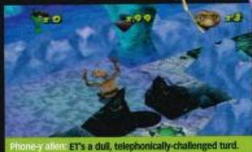
Phone-y alien: ET's a dull, telephonically-challenged turd.

buried in the Mojave desert. Ubisoft had a go on the PSone and their effort really wasn't worth anyone's attention. ET go home, as we say round here.