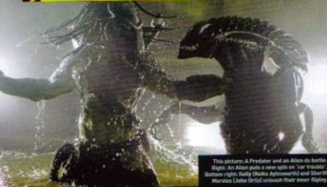
This picture: A Predator and an Alien do battle. Right: An Alien puts a new spin on 'car trouble'. Bottom right: Kelly (Reiko Aylesworth) and Sheriff Morales (John Ortiz) unleash their inner Ripley.