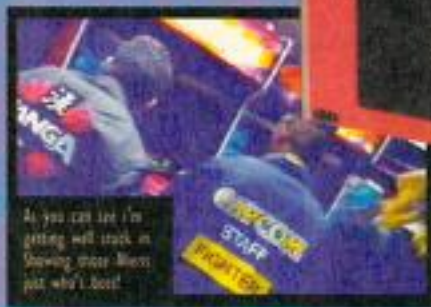
As you can see I'm getting well stuck in showing those Alien just who I best!

My initial fears were that enemy sprites would be too samey, however the graphic artist must have worked some serious overtime in producing a variety of new adversaries, without contravening the standard set by the ace movies. The upright unit has a pair of authentic pulse rifles built into the cabinet, but it's only when you actually pay your mo' that you get the full effect of the weapons. Each press of the trigger causes your marine-type weapon to recoil. Stunning. Being on free play I took advantage, by doing the lamest impression of Chuck Norris you've ever seen holding a gun in each hand. (the photo was over exposed, hehe).