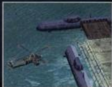
[ABOVE & BELOW] Soviet Strike successfully brings the series from 16 to 32-bit.