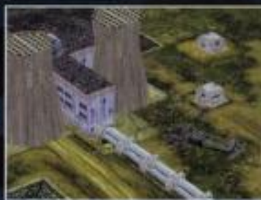
[Above] Crusader from EA is Project Overkill 's closest rival, but has far more strategy.