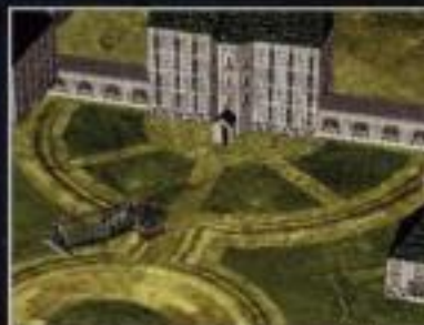
[ABOVE & BELOW] The objectives are still the same: shoot everything, rescue a few people.