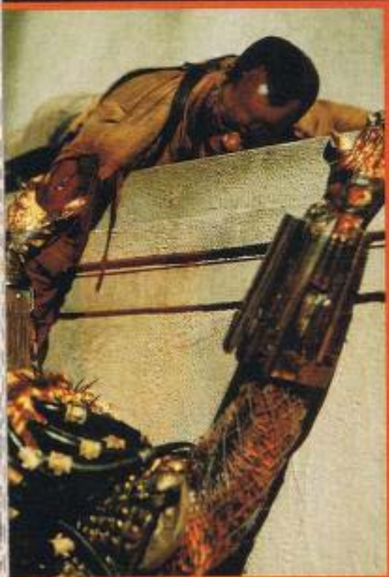
Filling in for the missing Dutch (Schwarzenegger), police detective Harrigan (Danny Glover) grapples with a younger, wilder creature (Kevin Peter Hall).

Predator 2 takes place in the environmental garbage can of 1997 Los Angeles, where drug lords are waging war over prized turf. Police detective Danny Glover attempts to keep law and order from breaking down while trying to uncover who's behind a series of grisly mutilation killings. Into this malaise walks the Predator, who is hot to hunt.