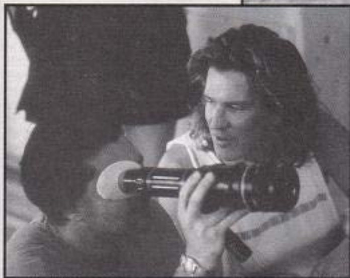
Stephen Hopkins (above right with long hair) has traded the horrors of nightmares on Elm Street for the pleasures of alien terror.

with good notices on A Nightmare on Elm Street 5: The Dream Child and a grade B thriller called A Dangerous Game , were instrumental in convincing the Predator folks, primarily producer Joel Silver, that Hopkins was the one to handle the inevitable follow-up to 1987's creature feature. And Hopkins has rewarded the confidence with what insiders are calling an excellent job of bringing the Predator into another kind of jungle.