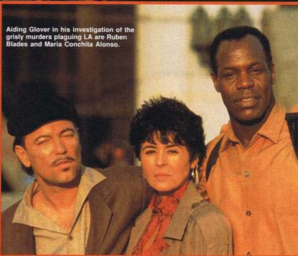
Aiding Glover in his investigation of the grisly murders plaguing LA are Ruben Blades and Maria Conchita Alonso.