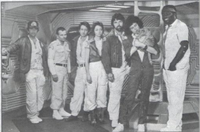
The crew: Technical Engineer Brett (Harry Stanton), Science Officer Ash (Ian Holm), Executive Officer Kane (John Hurt), Navigator Lambert (Veronica Cartwright), Captain Dallas (Tom Skerritt), Warrant Officer Ripley (Sigourney Weaver), cat and Engineer Parker (Yaphet Kotto).

Left: exploring the remains of an ancient alien civilization. The unearthly sets, and the alien itself, were designed by H. R. Giger.